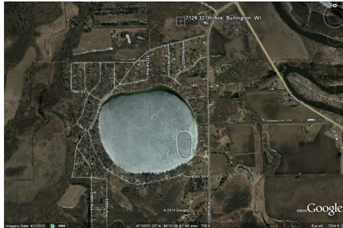
This image was taken April 2, 2013 from Google. Note the ice just coming off the lake and the outline of the ice racing course.

More details will be provided in the next newsletter.